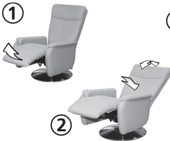
Abb.: Modell Senegal 2235